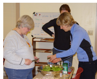
Willing Hands' volunteers gleaning at Edgewater Farm last fall and leading a Cooking Workshop last winter

We send our heartfelt thanks and look forward to seeing you at the picnic August 9.