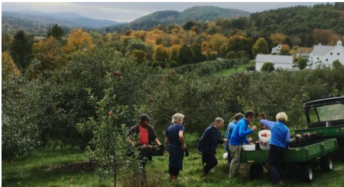
The View at Maplewood Orchard

We have had a glorious fall harvesting apples. Maplewood and Whitman Brook Orchards, have had plentiful harvests and were able to donate an incredible amount of fruit. This year we started regular "from the tree" gleanings at Maplewood Orchard in Woodstock, Vermont. As the picture shows, the apples