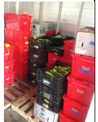
Our Cooler Full of Veggies

So we decided to double the size of the cooler within our garage. With timely help, we got the cooler built and running in a few short weeks—just in time to get a shipment of eggs. Some big THANK YOUs need to go out to Davis Frame Company of Claremont, NH who once again donated the panels that insulate the cooler walls and to Richards Electric Company of Wilder, VT for coming out on very short notice to finish the wiring so we could turn the new cooler on. Thank you for the support!